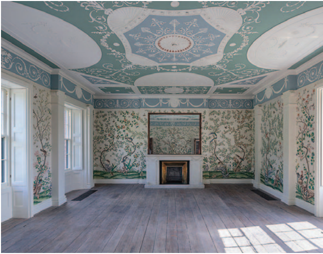
All pictures on this page Pitzhanger Manor

A number the of the finishes we recreated to match the original included hand painted Chinese wall paper to the drawing room, redecorating multicolored decorative ceilings and apply faux stone, marble and gaining effects throughout the project.