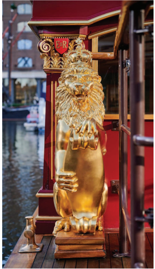
All pictures on this page Gloriana - Royal Barge